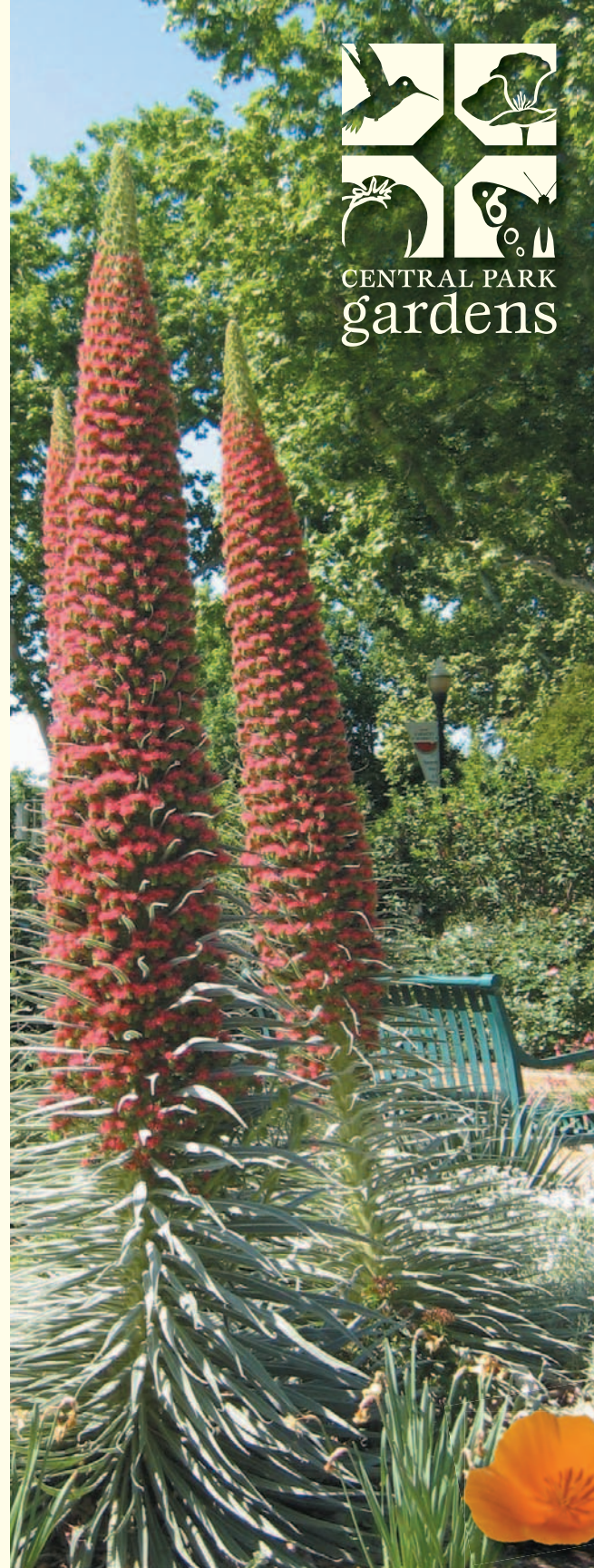
Cover image: Tower of Jewels ( Echium wildpretii )

*A 501(c)3 non-profit organization; all gifts are tax-deductible.