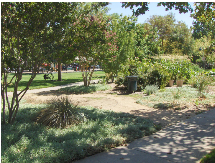
Figure 1. Image of project location looking southeast from B Street.

The project area has recently served as a staging ground for garden construction projects. This area will be redefined with new path edging, leveled, and resurfaced with decomposed granite this fall as part of a pathway renovation initiative.