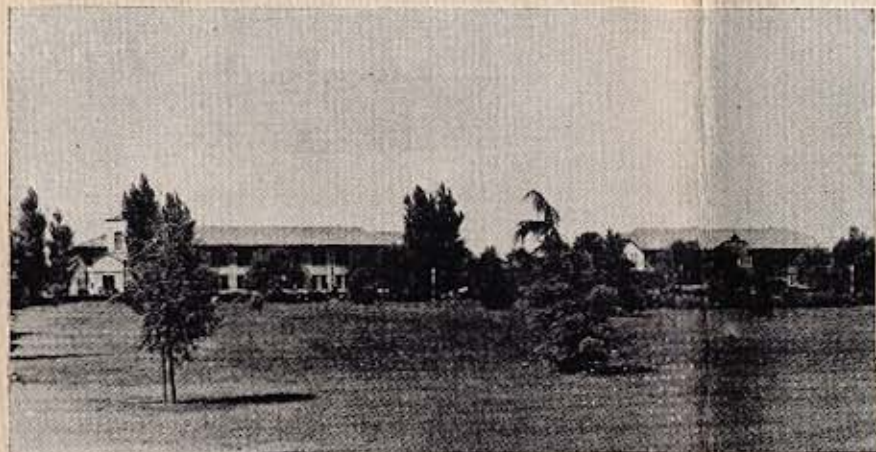
Campus Scene, College of Agriculture

Davis rightfully boasts of all the conveniences en-