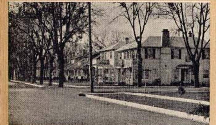
A City of Fine Homes

FOURTEEN miles west of Sacramento, and located at the junction of the Southern Pacific's main lines to the north and east is the city of Davis, the home of the College of Agriculture, University of California. Because of its superb soil and irrigation facilities, the State selected Davis as the ideal location for what has now become one of the fore-