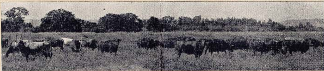
Dairying Is a Source of Income

Agricultural instruction was first established here by the University of California in 1908 and during the thirty years of development the College has grown to an attendance of more than 1100 students regularly enrolled in the various branches of agriculture and home economics. The College holdings consist of 1079 acres of land that constitute one of the most impressive agricultural projects in the state. There are forty modern buildings used for