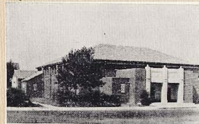
High School Gymnasium

Regularly organized activities are Publications,