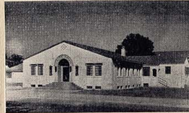
New City Hall

of Agriculture was made after careful and intensive study by the Regents of the University of California. Many sites at different points in the state were given thorough consideration, but because the land, water, transportation facilities, climate and other requirements, deemed desirable, were here, the