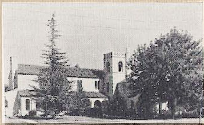
One of the Fine Churches

joyed by city folks. It has electricity, gas, telephones, municipal water and sewer systems, paved streets, curb and gutter, sidewalks, city and rural mail delivery, telegraph service, churches, theatre, city park, new city hall and all of the things which go to make up the happy and contented community. Be-