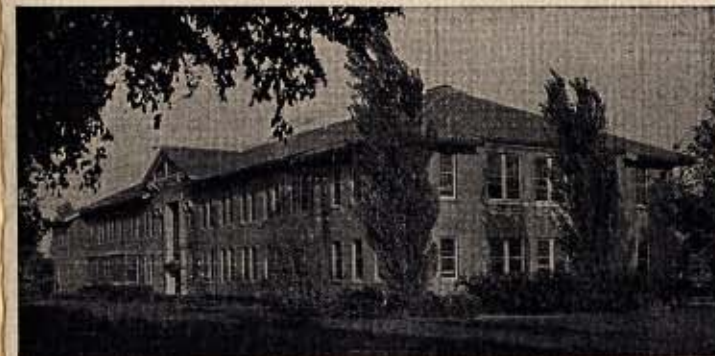
Dairy Industry Building, University

Anyone desiring information concerning the city of Davis may write to the Chamber of Commerce