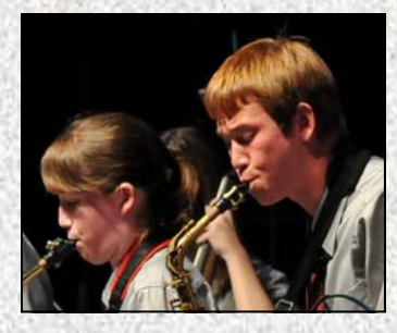
SYMPHONIC & JAZZ BAND CONCERTS ~ Nov. '10 ~