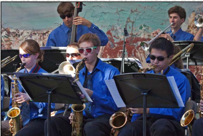
JAZZ BAND @ Davis Jazz & Beat Festival Oct. 22, 2011