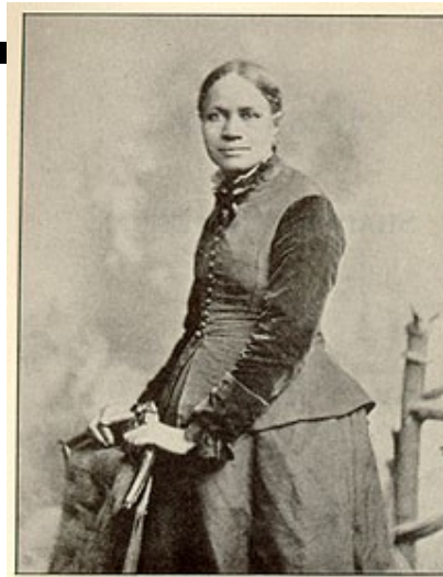
Frances E. W. Harper

Here again, Harper tailored her activism to reach the African American community. She