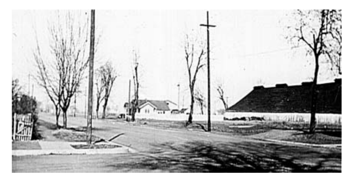
# 7. Looking north along G Street from Fifth, 1938. Plant's grain storage warehouse is on the right. 536 G, at the southeast corner of Sixth and G, is in the distant middle of the photograph. (Clarence Berry.) Lofland & Haig, p. 112.