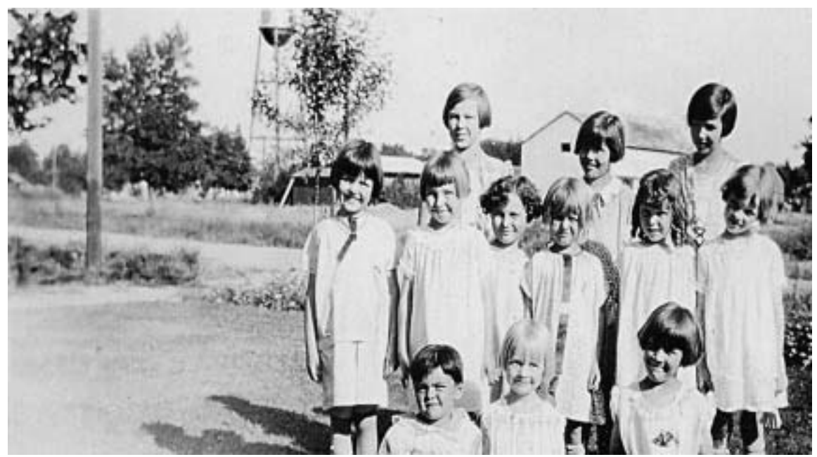
# 15. Looking southeast near the intersection of Seventh and C Streets, mid-1920s. The Davis water tower, located at 616 D Street, is in the upper middle of the photograph. Lofland & Haig, p. 114.