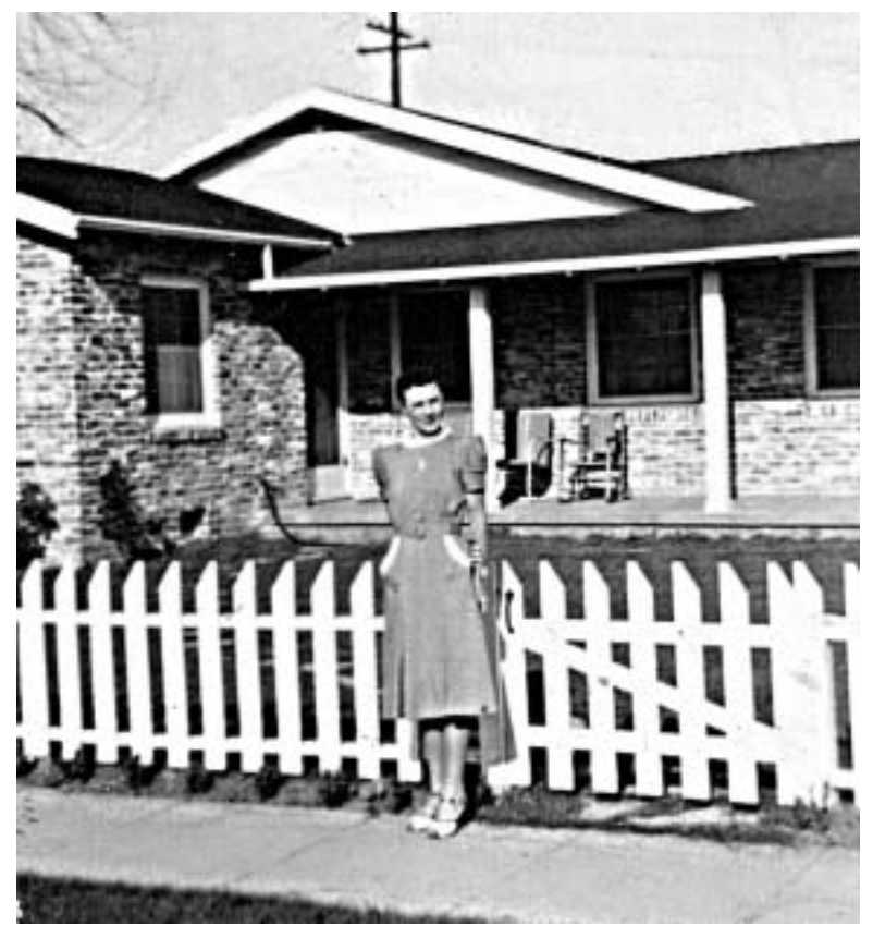
# 14. 642 D Street, 1940.