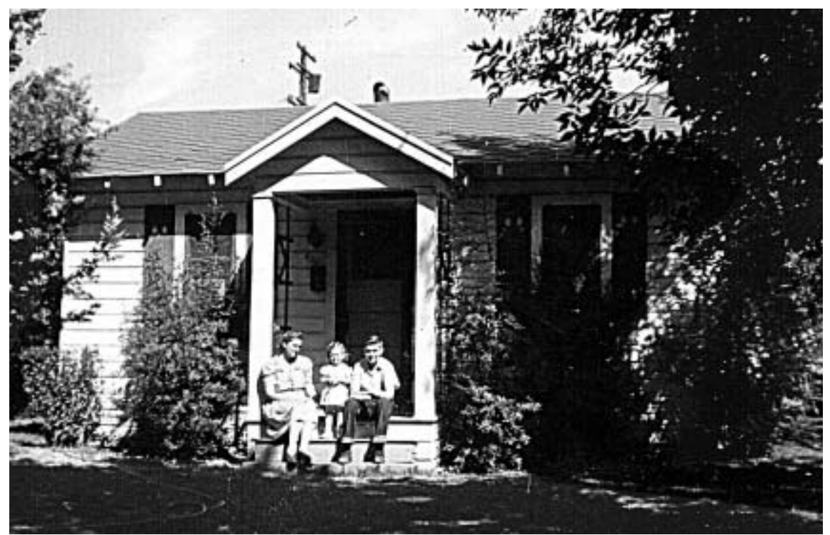
# 11. 630 E Street, mid-1930s. This is one of three very small homes built in a row on E Street at about this time. The other two are just to the north of this one. Lofland & Haig, p. 115.

# 10. Classic bungalow at 619 F Street, about 1920. Lofland & Haig, p. 112.