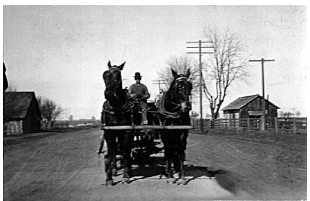
# 1. Looking north up G Street at Fifth, about 1910. The shack to the right is next to the railroad and used by the many transients of the time ("hobos"). The house shown in picture # 3 is just out of view to the left in this picture. (Information and picture from Isabelle Ray Dolan, who grew up in the house shown in picture # 3.) Lofland & Haig, p. 109.

This compilation is not a substitute for the pictures and text presented in Lofland and Haig. Instead, it is intended to encourage people to look at the book itself—as well as to stimulate their historical appreciation of the area. The quality of pictures on the web is necessarily less than the quality found in printed pictures. In Lofland and Haig, these same pictures contain a great deal more detail. In addition, both the explanatory text accompanying these pictures and the photographs themselves represent only a small portion of what Lofland and Haig provide.