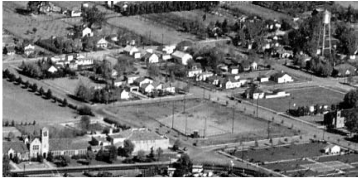
# 6. Looking northeast over what is now the "Old North," about 1939. The high school, now the city hall, is in the lower left. Lofland & Haig, p. 117.