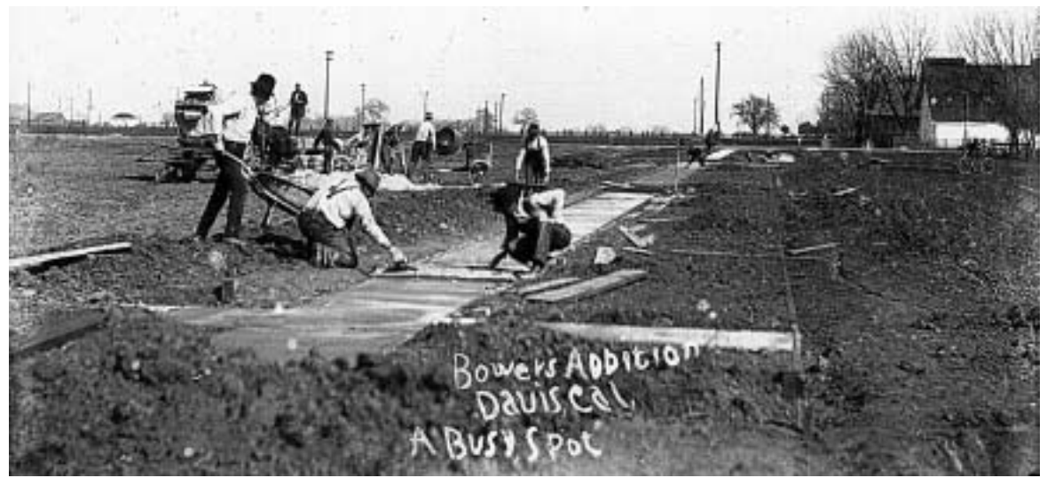
# 4. Laying sidewalk in Bowers Addition, February, 1913. The northern end of Plant's grain warehouse is seen on the right. These workers are laying sidewalk that is still there near the corner of Sixth and E streets. (UCD Special Collections.) Lofland & Haig, p. 111.