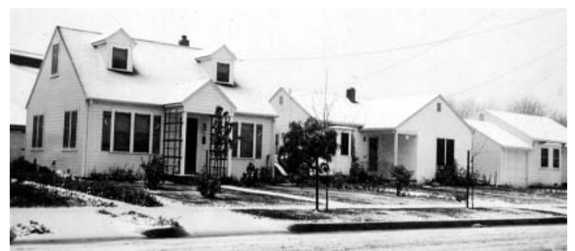
# 8. Snow on G Street, March 20, 1942. From the left: 526, 512, and 506 G street.