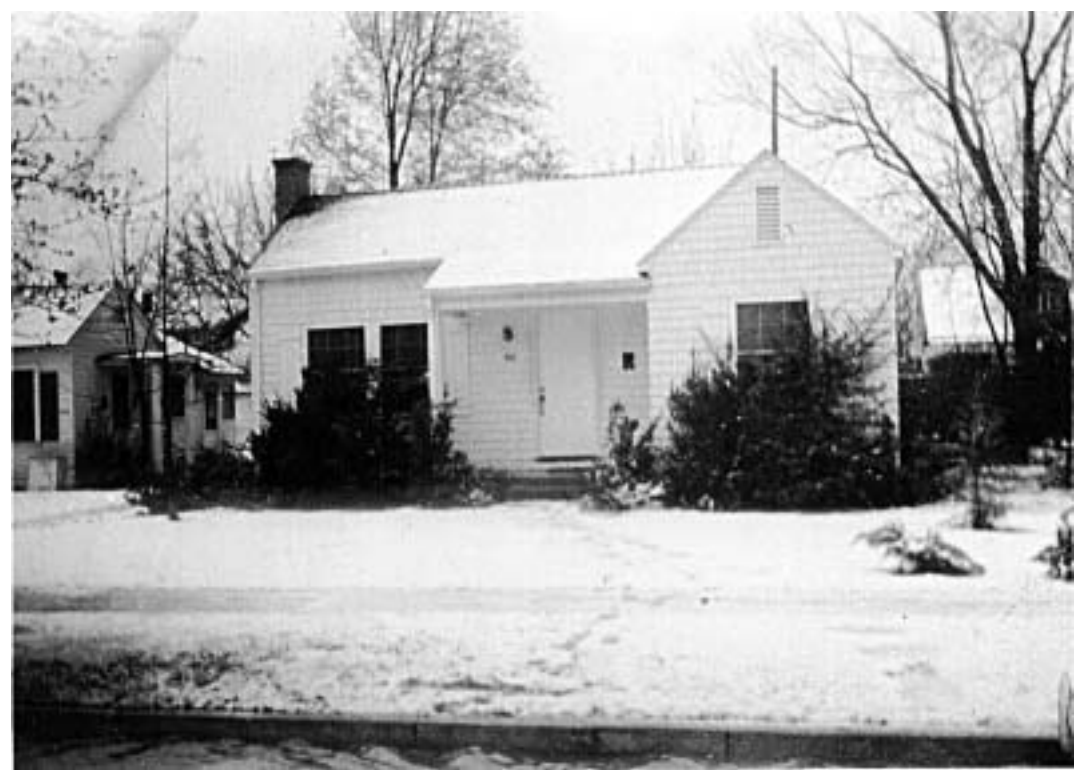
# 12. 618 E Street, 1942. This was one of several houses moved in order to clear the block that is now Central Park. (Helen Rowe.) Lofland & Haig, p. 115.