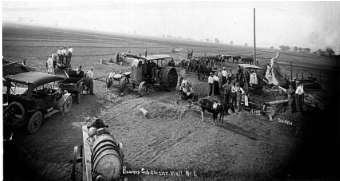
# 5. Drilling for water in the vicinity of F and Eighth streets, August 8, 1913. Lofland & Haig, p. 111.